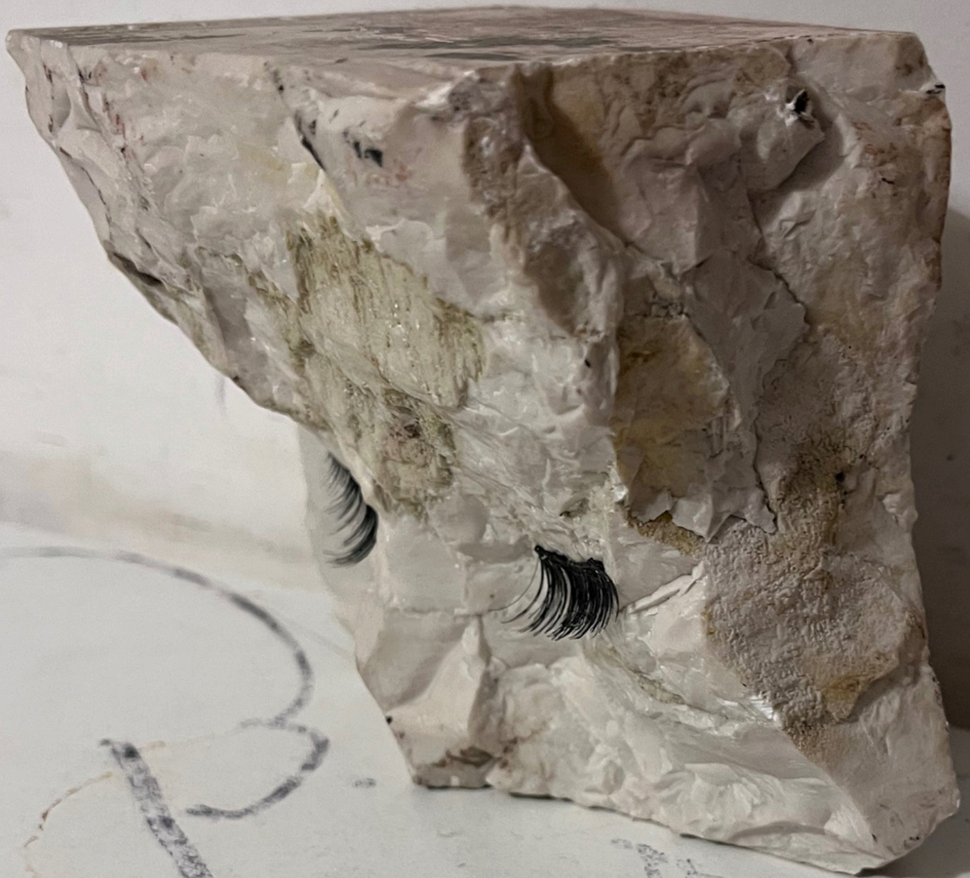
fake eyelashes on marble stone 10x10 cm, 2022