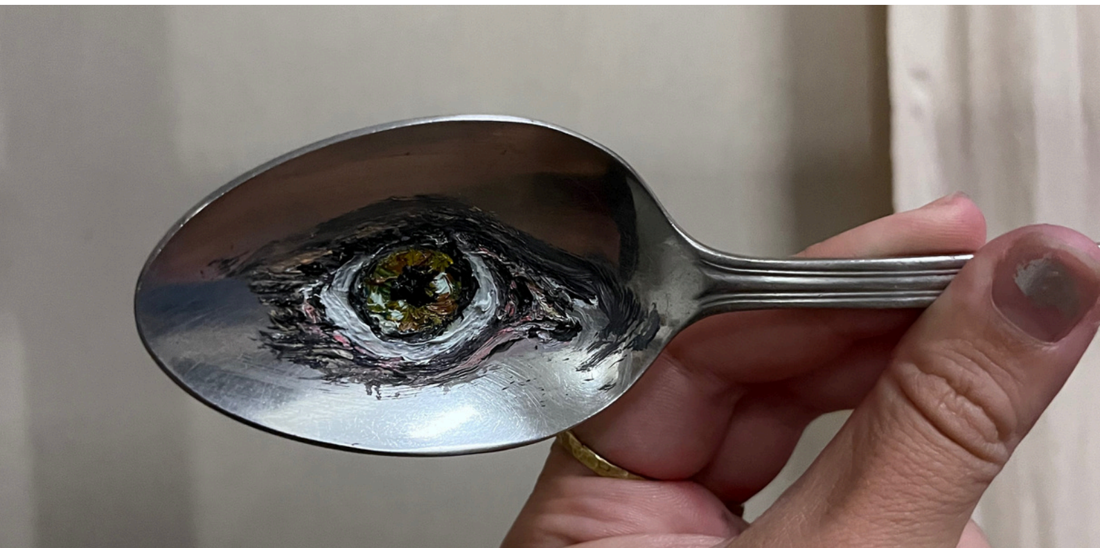
S.K. oil on spoon, 5x15 cm, 2024, SOLD

Her painting does not describe—it transfigures. It does not represent—it converts. It operates as a radical threshold where the visible is consumed, leaving energy, memory, and spirit.